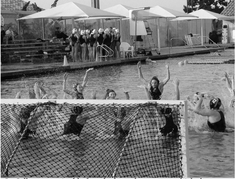
La Jolla gets excited before the legendary game, which they won, versus Bishops. (Top)

This intensity has brought the team to a whole new level, and they expect to make more history before the season is over.